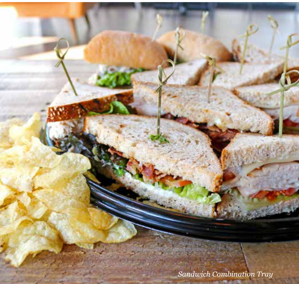
Sandwich Combination Tray