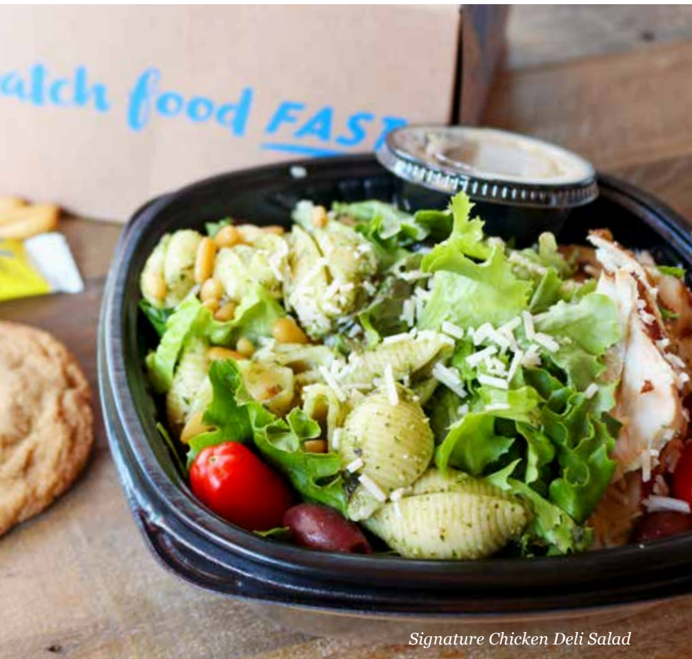
Signature Chicken Deli Salad