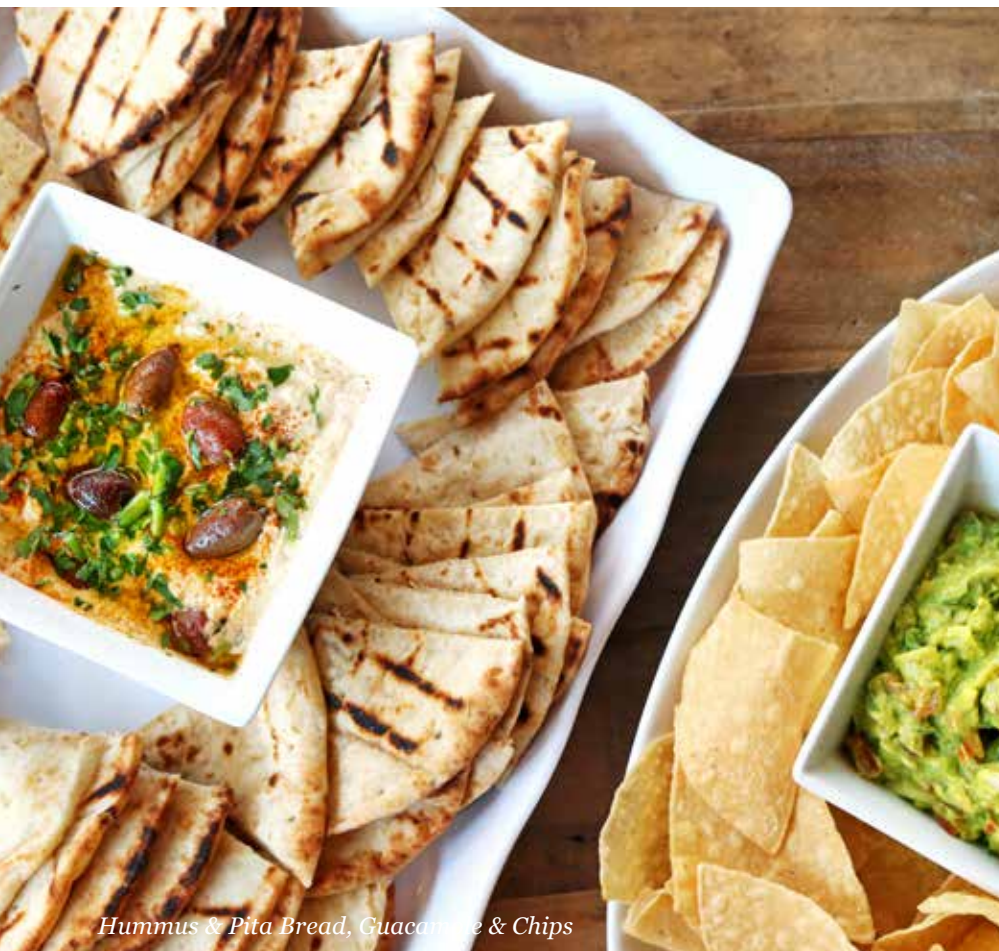
Hummus & Pita Bread, Guacamole & Chips