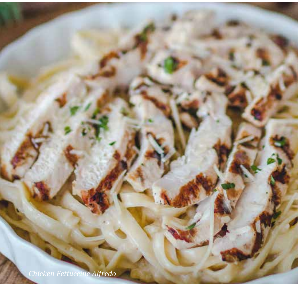
Chicken Fettuccine Alfredo