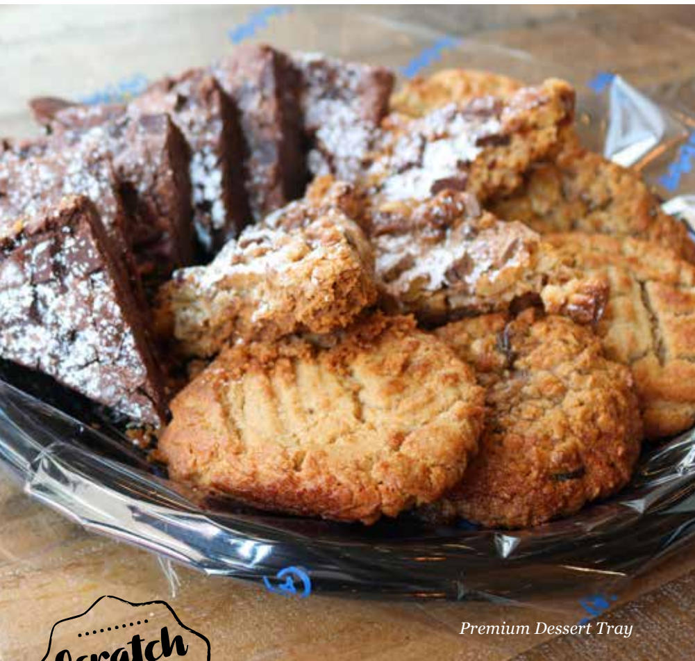
Premium Dessert Tray