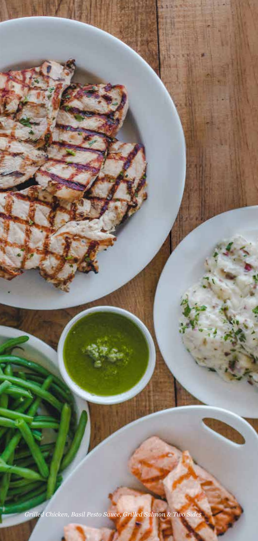
Grilled Chicken, Basil Pesto Sauce, Grilled Salmon & Two Sides